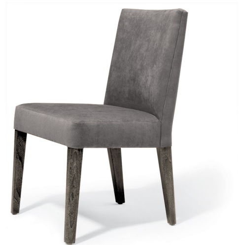
Corinne Side Chair