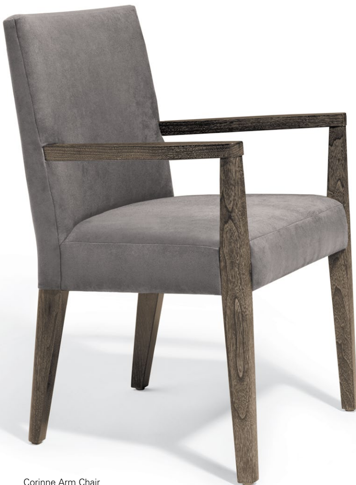
Corinne Arm Chair